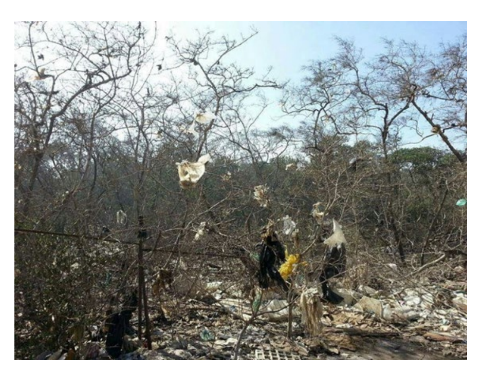
Protected mangroves are dying and sea is being contaminated