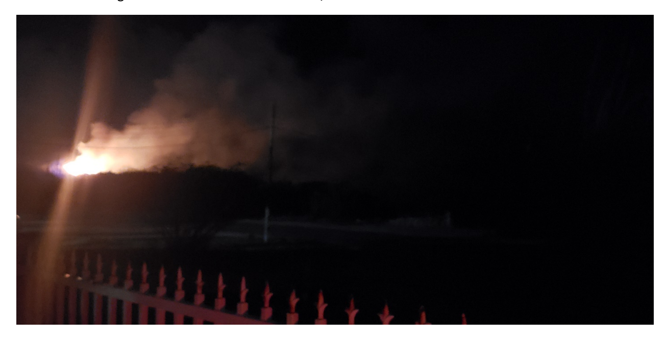
View from my home during night time