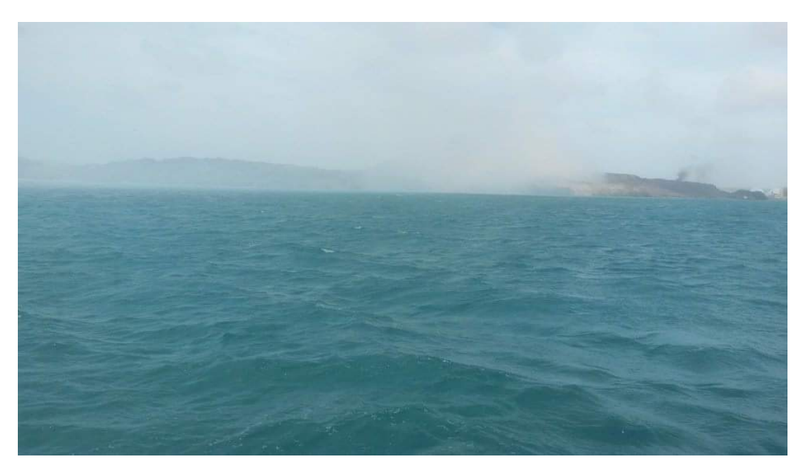
Pollution of mangrove and reef Area Parkietenbos/Bucuti