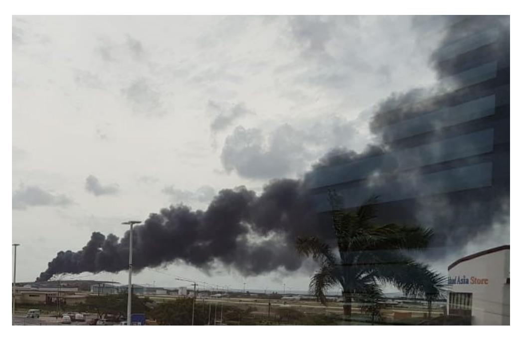
View from far