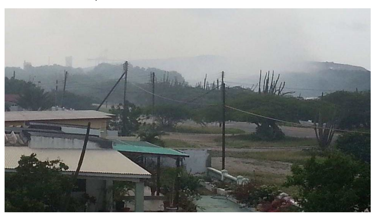
My neighbourhood, homes constantly polluted by toxic smoke