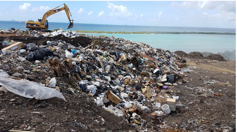
Uncontrolled dumping of all kinds of waste