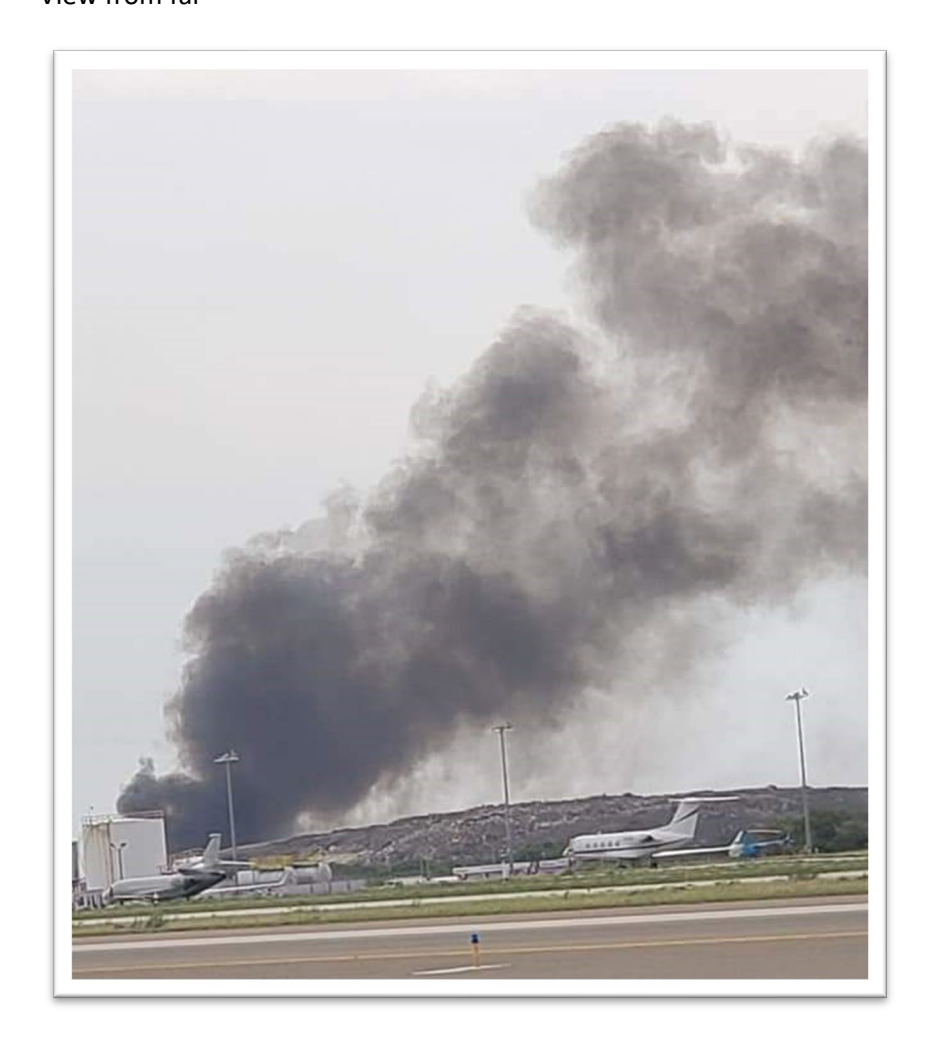
Airport, danger for landing planes